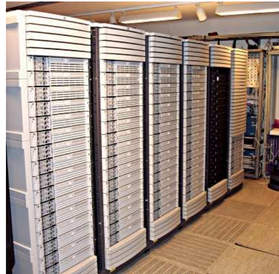
90 dual Itanium 2, 900Mhz