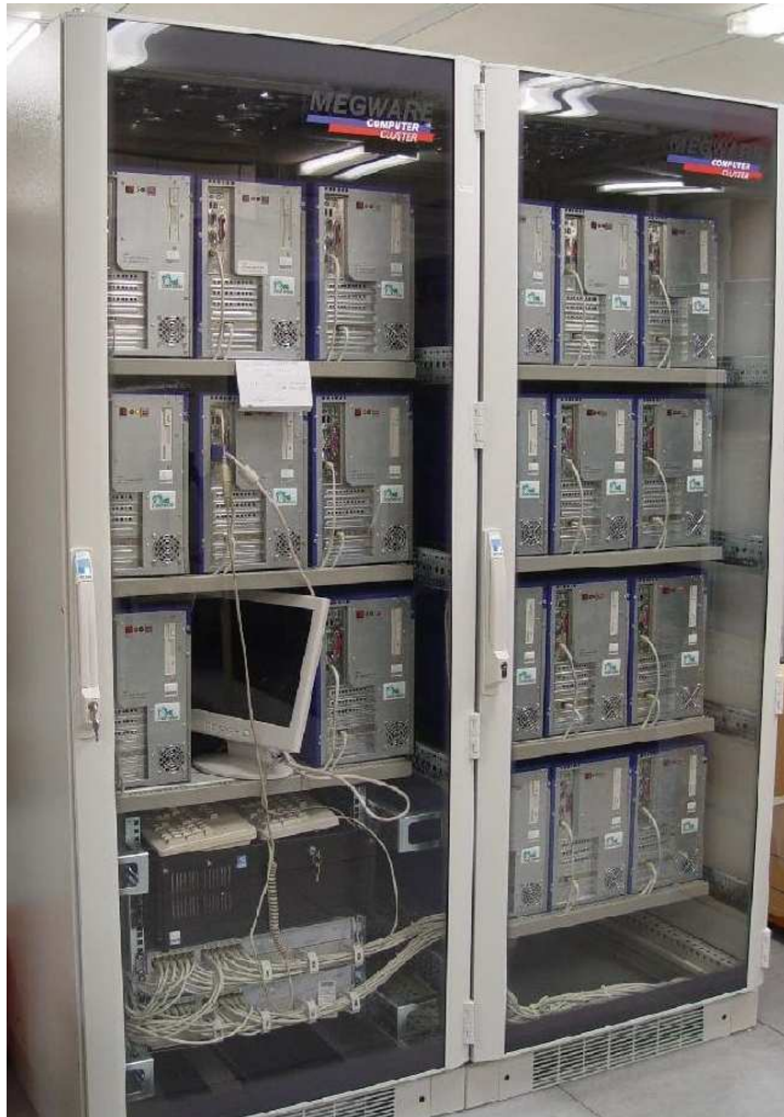
20 nodes dual XEON, 2.4 GHz

Who likes to install these hosts by hand?